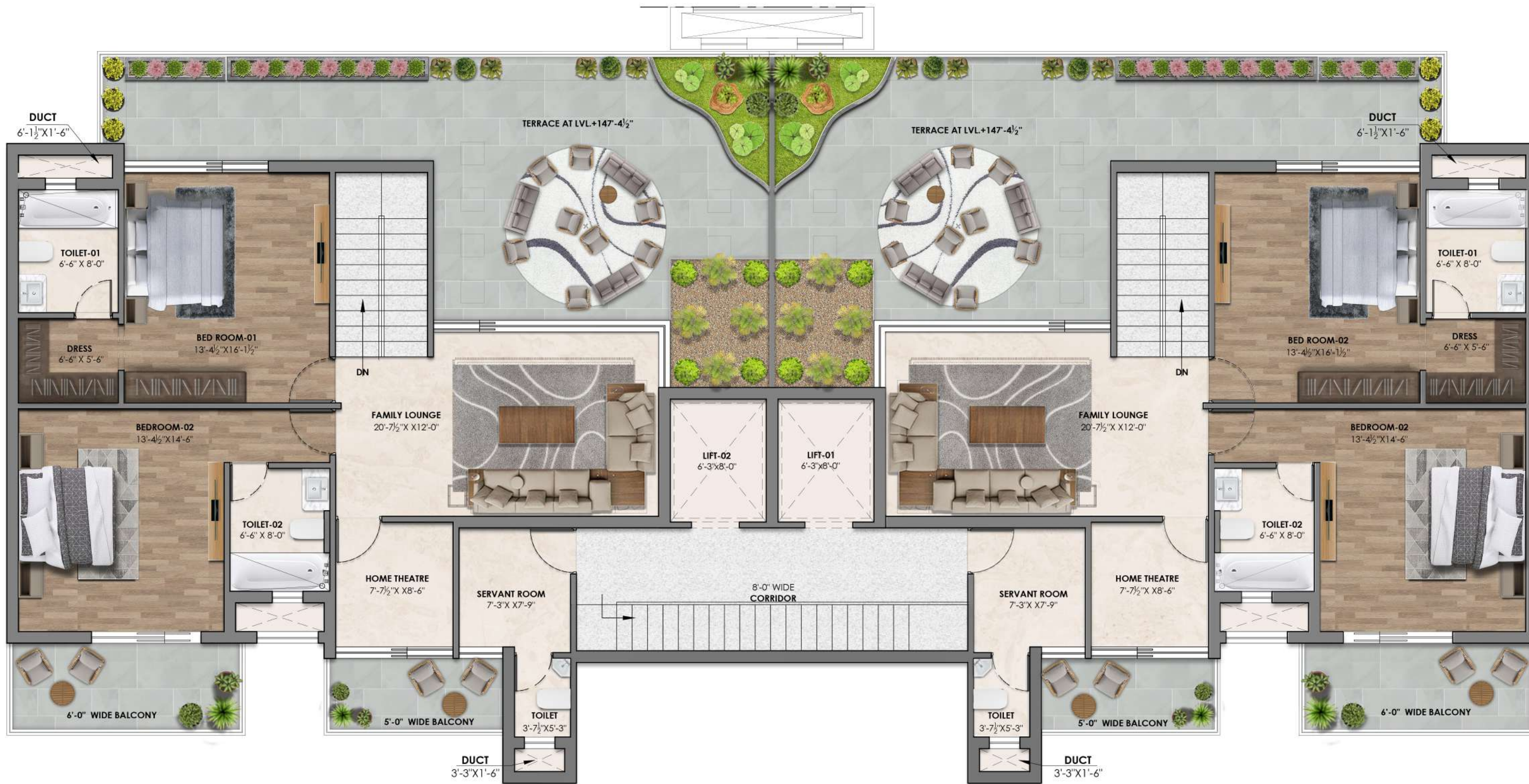
UPPER PENT HOUSE BLOCK - A (SUPER AREA= 1534.22 SQ.FT)