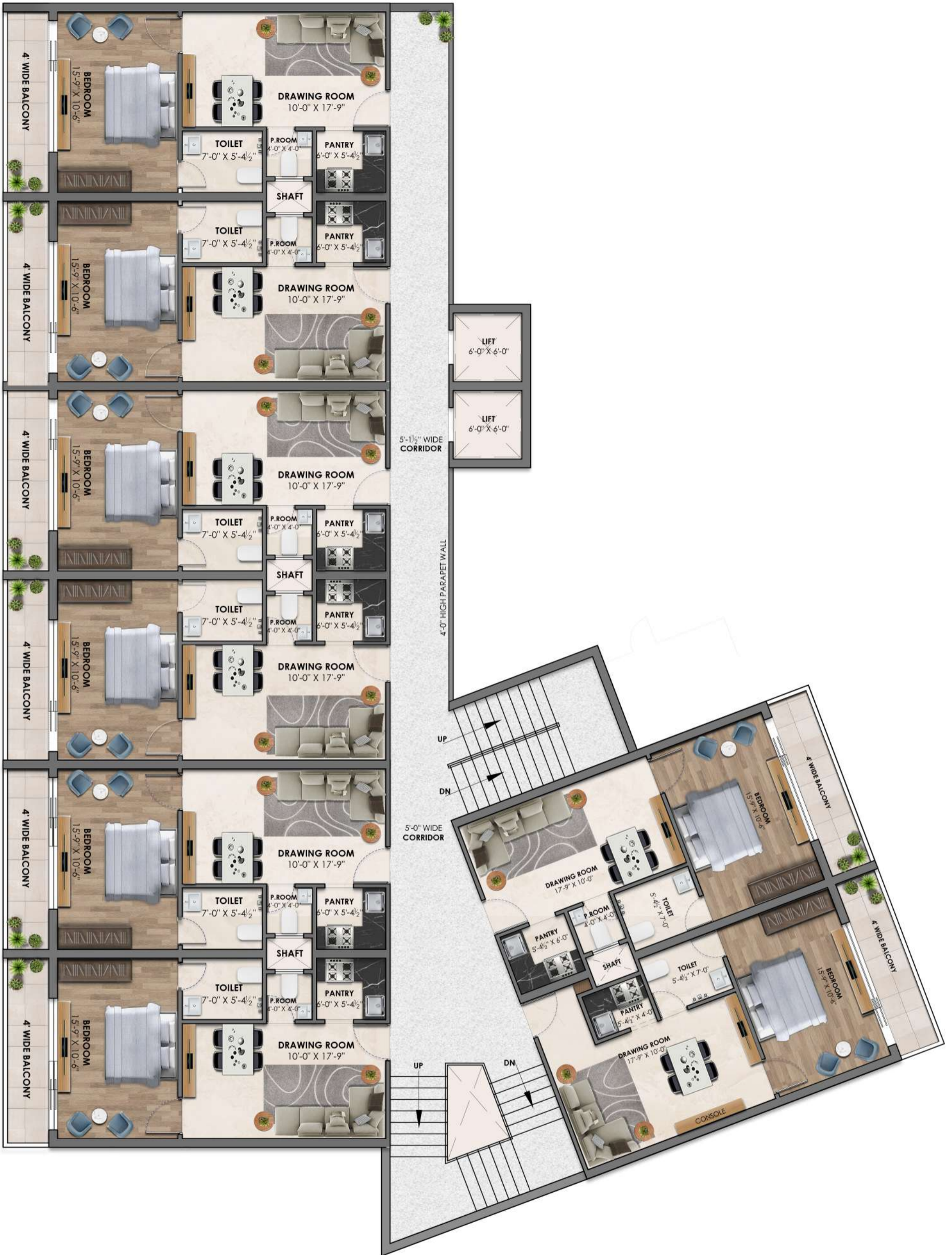
TYPICAL FLOOR PLAN 1BHK SUPER AREA = 700 SQ.FT.